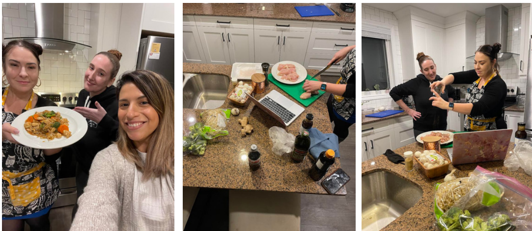
Pictures from a cooking night, facilitated by one of the peer participants to increase skills in planning, budgeting, and cooking.

While there will always be room to grow and adapt with the needs of the individuals we support both in the community and eventually through Nancy's house, what we have been able to nurture as a team offers something that has been missing in our community: the ability for survivors to know that they are welcome, worthy, and valued at each level of our program – from participant to peer advocacy roles.